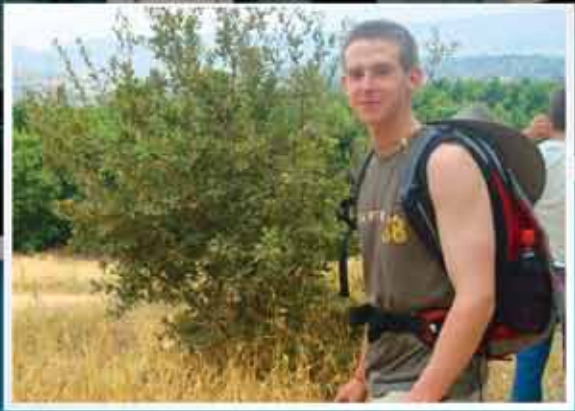
Feast Photos by: Per Kvamso Front Cover photo by: Meredith Holbrook

Join the 2011 Feast Tour October 9-19 > See inside for details! For Online Registration go to: www.grafted.org